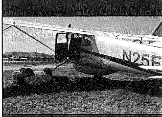
First cross-country flight