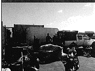
Unpacking house container