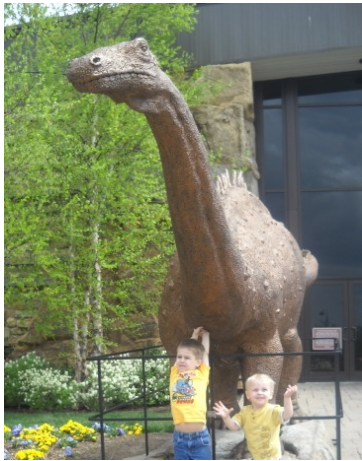
Creation Museum in Kentucky