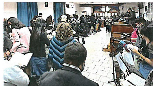
Honor Israel in Buenos Aires