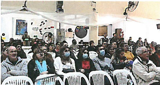
Honor Israel in Tucumán