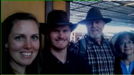
Dropping off Dad & Mom for their flight