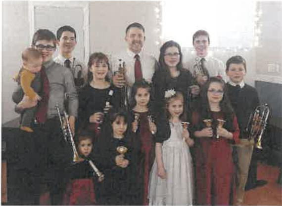
After the Christmas Concert