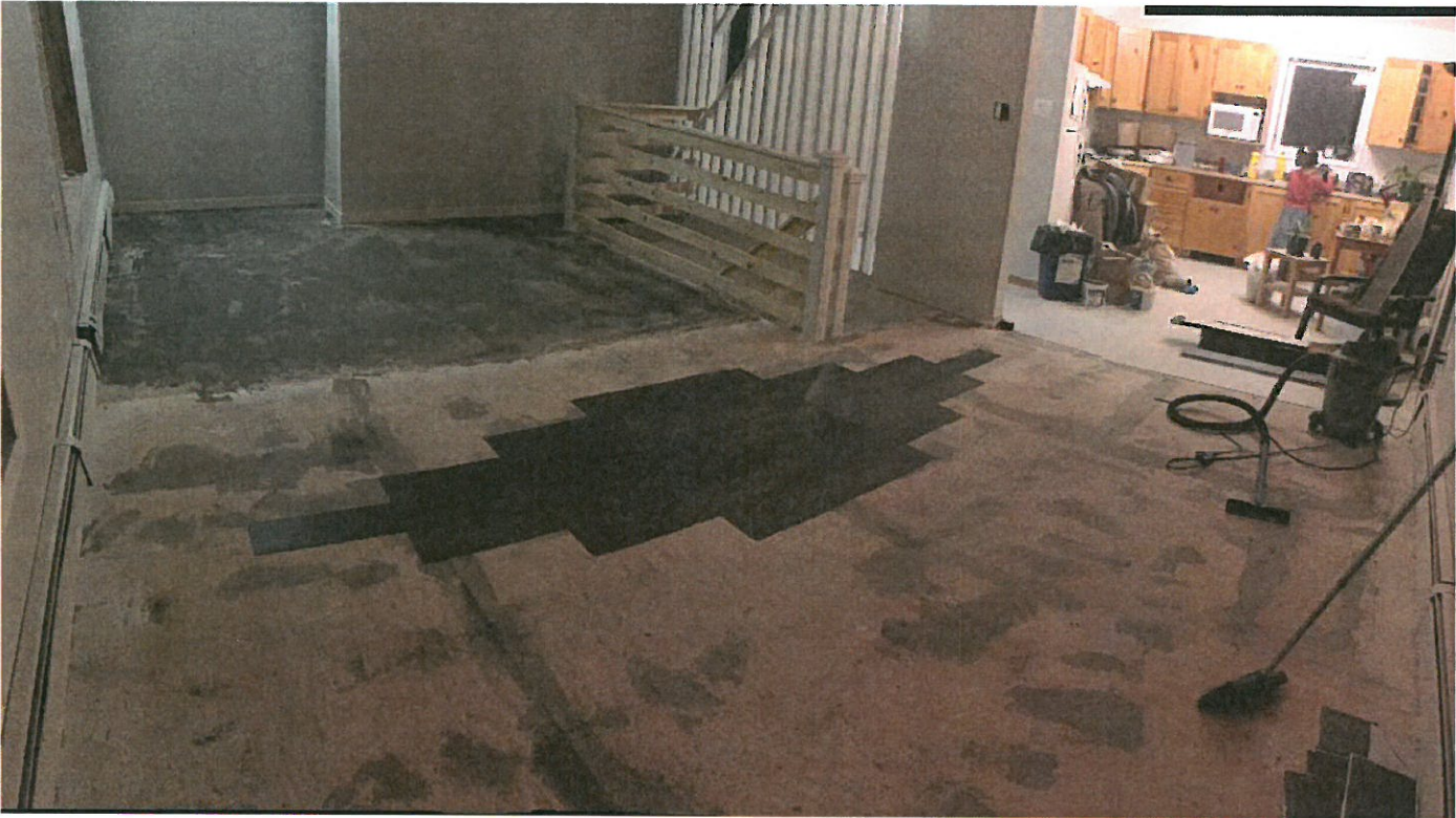
Before and after of our upstairs living room and kitchen area. Stairwell and railing had to be built, a wall removed, drywall work, painting, flooring, and electrical... lots of work!