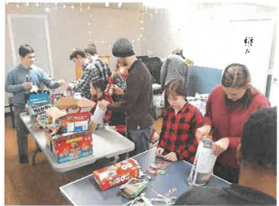
Stuffing Christmas Gift Bags